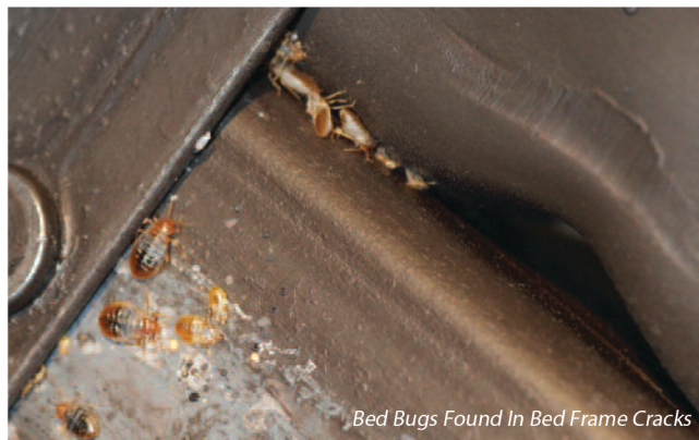
Bed Bugs Found In Bed Frame Cracks

A: Because Bed bugs are small and flat, they are able to squeeze into tiny cracks and crevices on the mattress and box spring, behind headboards, and inside furniture. They prefer to live in groups and are often found in clusters where the adults, nymphs and eggs are together in a protected area.